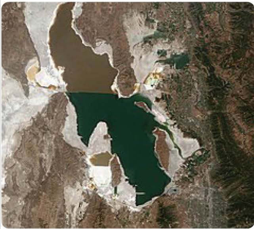
A shrinking Great Salt Lake will reach a historic low water elevation in 2021.