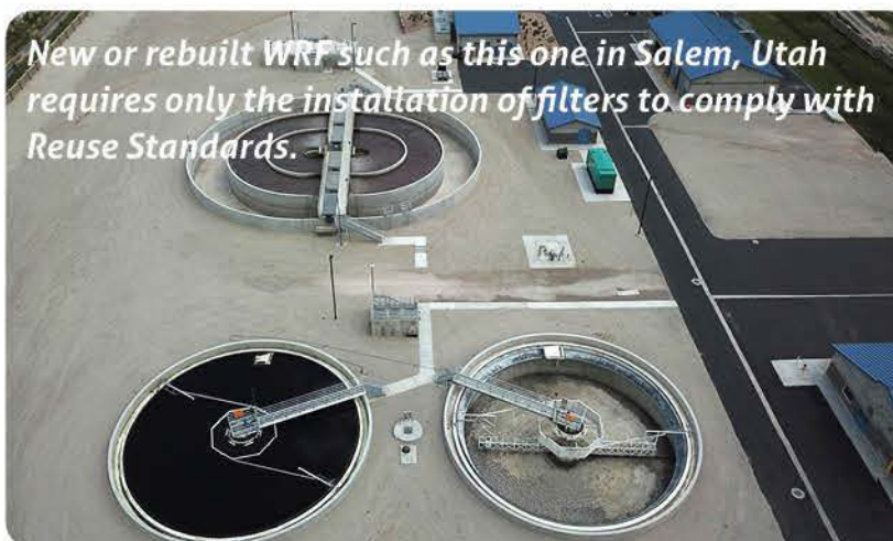
New or rebuilt WRF such as this one in Salem, Utah requires only the installation of filters to comply with Reuse Standards.

Almost all the WRF can either now meet or will in the next few years be able to meet all of the numeric discharge standards for reuse with the exception of the requirement found in R317-3 requiring an approved filtration process for Type I reuse. In addition some facilities may need to add chlorination equipment, too. The costs for filtration are dependent on the size of facility and the type of filters used. Filters could be cloth media filters, or they could be membranes. The range of costs for filtration could be as little as $250,000 per million gallon a day (MGD) treatment capacity up to $1,400,000 per MGD. While this is costly, it is much less than the cost of developing new water sources. In addition to the cost of filtration, there is also the cost associated with the delivery of water to the end users. The transportation of water to the end user could be as simple as tying into a nearby secondary water system or it could involve transport over a significant distance. As such, the cost increase for transport is highly variable.