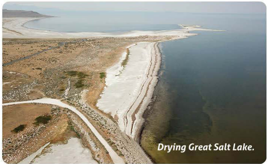
Drying Great Salt Lake.