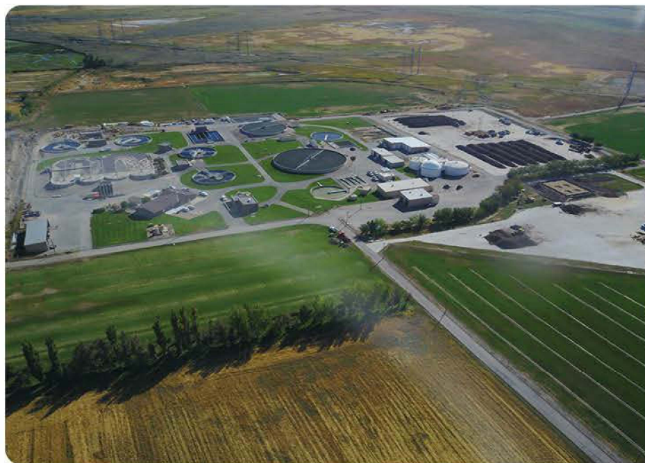
Central Davis Sewer District provides water for a significant wetland area in GSL.

Several wetlands, particularly in Farmington Bay are fed with water from WRF's. These wetlands support millions of birds and other aquatic life that will be affected if the water is diverted to reuse and the wetlands dry up. 80% of all Utah wetlands are around the Lake. Other wetlands may remain, but the loss of any wetland area creates a loss of habitat in the ecosystem.