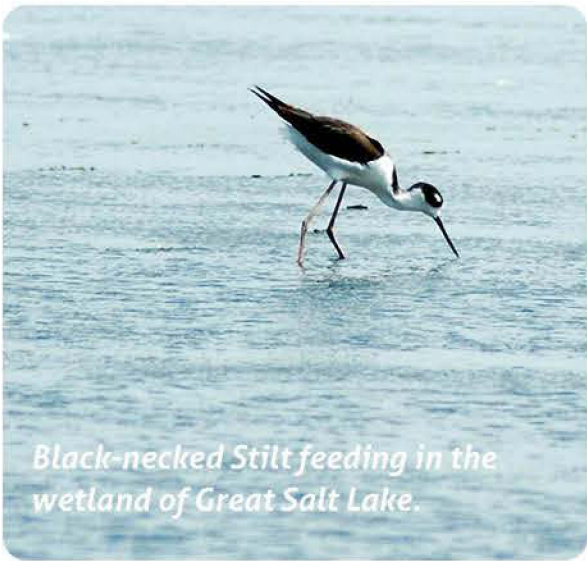
Black-necked Stilt feeding in the wetland of Great Salt Lake.